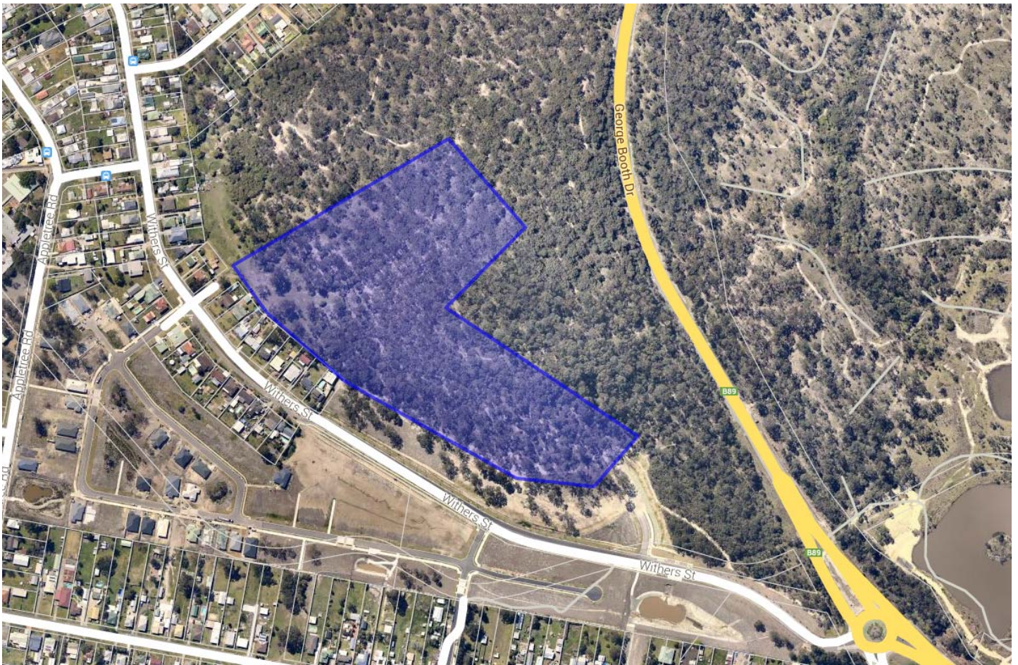
General site layout – Stage 4 Appletree Grove Estate